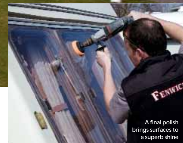
A final polish brings surfaces to a superb shine