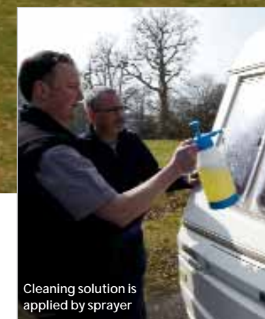
Cleaning solution is applied by sprayer