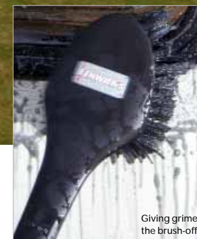
Giving grime the brush-off